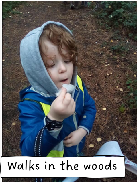
Walks in the woods